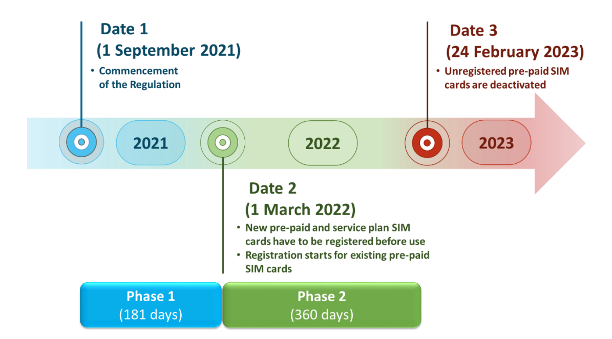
Figure 1: Timeline of Implementation Schedule

3.1.1 Upon commencement of the Regulation on Date 1, the registration of SIM cards is implemented in two phases with the timeline shown in Figure 1 below.